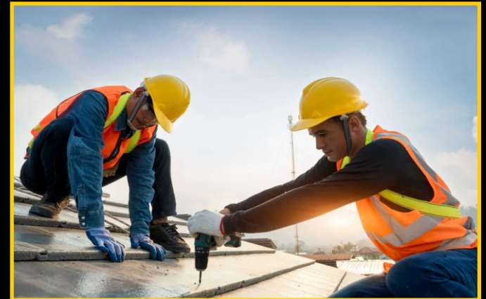
MAINTAINING THE WALLS