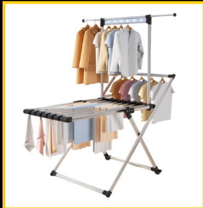
LAUNDRY & CLOTHING DRYING AREA