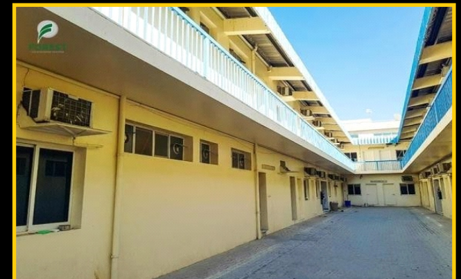
ABDULLAH OBAID CAMP

This Camp Has The Capacity Of 350 Peoples Which is located at Al Qusais (Dubai) PLOT # 264-1104