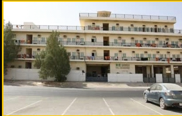
AL MUSALLAS CAMP

This Camp Has The Capacity Of 430 Peoples Which Is Located At Al Qusais (Dubai) PLOT # 264-0819