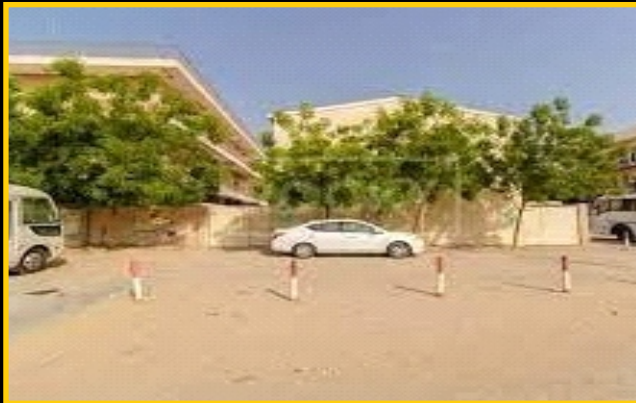
This Camp Has The Capacity Of 1080 Peoples Which is located at Al Qusais (Dubai) PLOT # 264-390