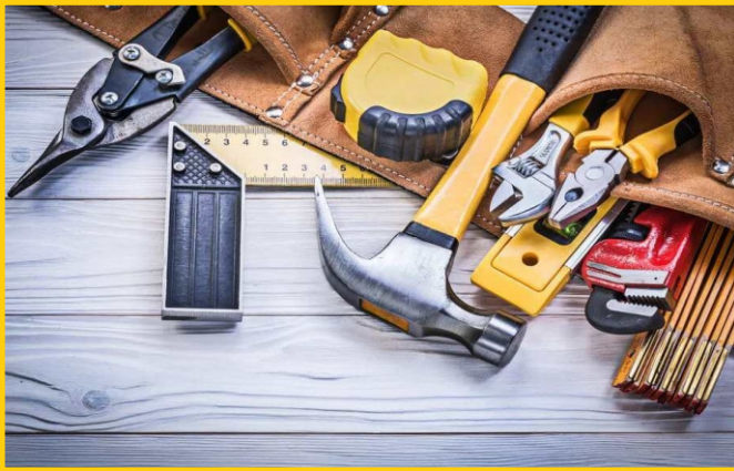
ACCESS CONTROL SYSTEMS

We Ensure That Your Building Is Operational From Top To Bottom. We Work Towards Improving The Standards And Maintaining The Roof, Walls, Floor, And Access Control Systems Etc. Of The Building.