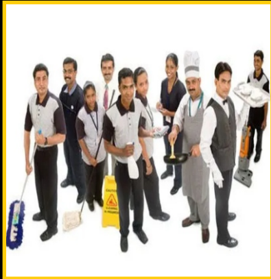
MANPOWER SERVICES & STAFF SUPPORT