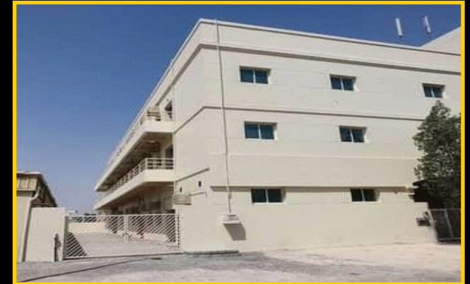
NASSER RASHID LOOTAH CAMP

This Camp Has The Capacity Of 1500 Peoples Which Is Located At Muhaisnah-2 (Dubai) PLOT # 253-0