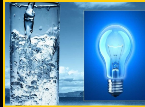
ELECTRICITY & WATER FACILITIES