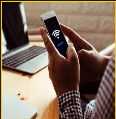
HIGH SPEED WIFI