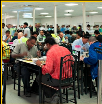
SPACIOUS KITCHEN & DINING