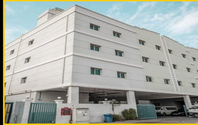
This Camp Has The Capacity Of 460 Peoples Which is located at Musaffah-44 (Abu Dhabi) PLOT # 36-02B