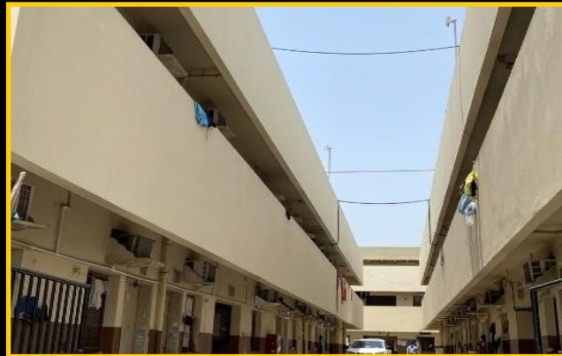
This Camp Has The Capacity Of 380 Peoples Which Is Located At Al Qouz (Dubai) Plot # 365-621