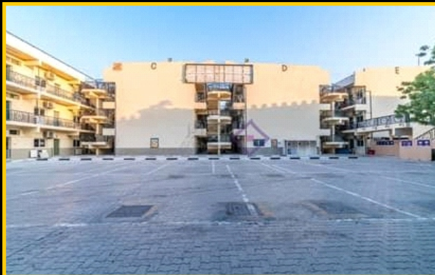
AHMAD ALI ALHADAD CAMP

This Camp Has The Capacity Of 750 Peoples Which Is Located At Al Qusais (Dubai) PLOT # 0264-0410