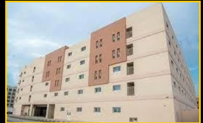
This Camp Has The Capacity Of 420 Peoples Which Is Located At Musaffah (Abu Dhabi) Plot # 1992-1043