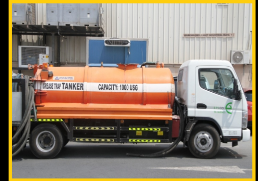
GREASE TRAP & WATER TANK CLEANING