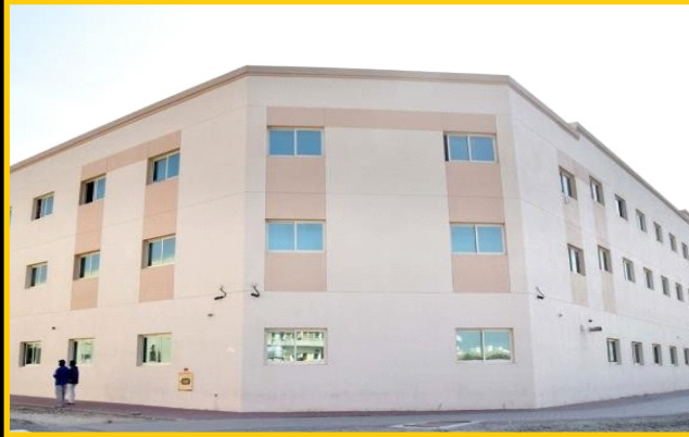
This Camp Has The Capacity Of 520 Peoples Which is located at Al Qusais (Dubai) PLOT # 264-110