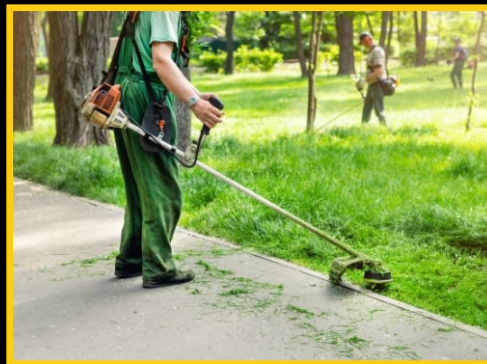
GROUNDS GARDEN MAINTENANCE