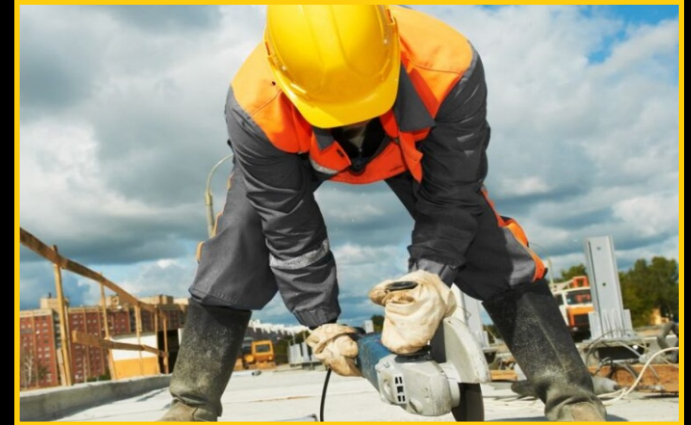
MAINTAINING THE ROOF